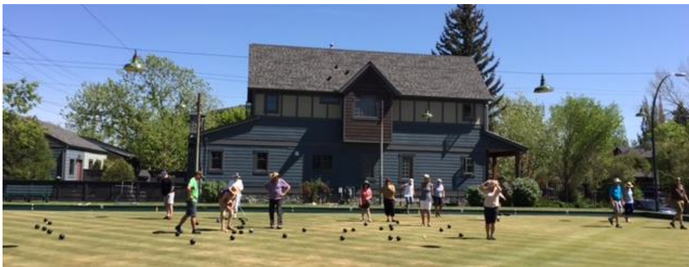
Bow Valley Club pictured above – one of the fastest growing community clubs in 2017.

To grow our sport, the member clubs need to be vibrant and highly visible in their communities. We need to offer them support in meeting the biggest challenges they struggle with. Our association must aim to facilitate increased collaboration among the clubs to ensure they share best practices, support each other in hosting events, and meet their needs of increasing membership. A representative from each member club on the newly formed Marketing & Membership Committee will create an avenue for creating awareness of our sport and increased participation in bowls not only in the neighborhoods of the clubs but across the province.