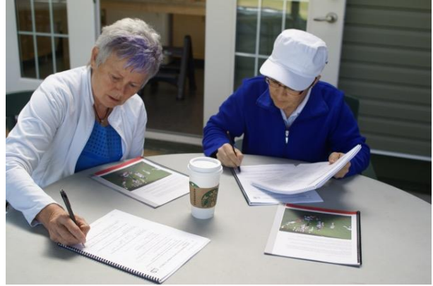
Club Coach course taught in Calgary

The first year of this plan will be challenging and dependent upon leadership and volunteer efforts. But an annual evaluation and readjustment of goals will help direct each new year. With annual reports of accomplishments and shortfalls we anticipate an increased understanding among our member clubs of the direction we are heading as well as of the challenges we are facing. Growth and celebration is inevitable as we look towards celebrating the 30 th anniversary of our association amidst several 100 th anniversary celebrations occurring at many of our member clubs over the next few years.